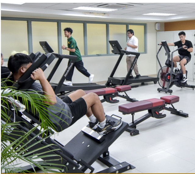
The newly opened Wellness Room at the Arts Bldg.

With regards to wellness, while we don't claim to have all the solutions as it is a complex area, we strive to make FEU a safe place for expression not only of preferences, but also of apprehensions and anxieties, without any judgement and with purpose to help and address. Our Healing Spaces and Wellness Room facility are now operational, offering students a place for guided reflection alongside other student services. We likewise include organized opportunities for physical activity throughout the stay at FEU, some as part of the mandated curriculum but others, on a purely voluntary basis, to provide recreation and relaxation.